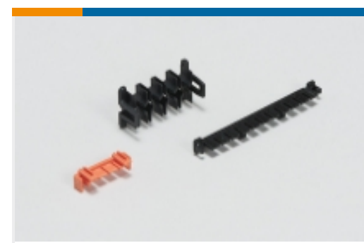
Rectangular Connector Locking(14)